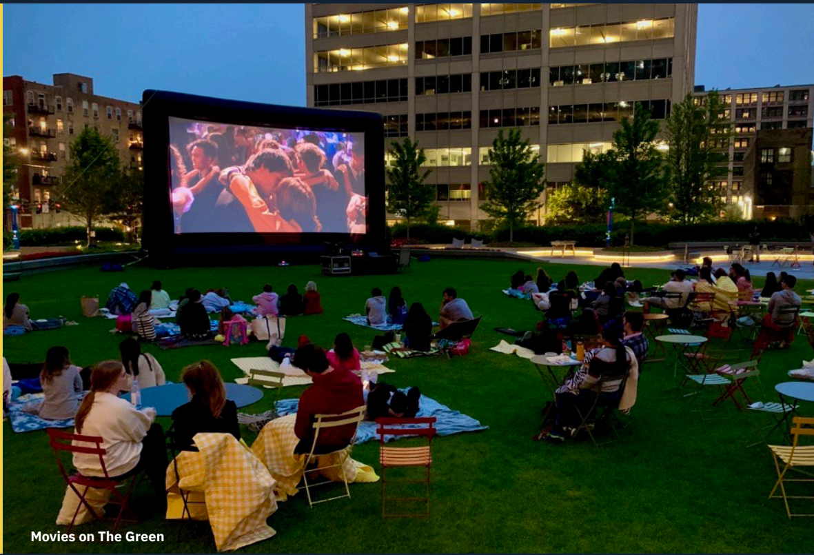
Movies on The Green