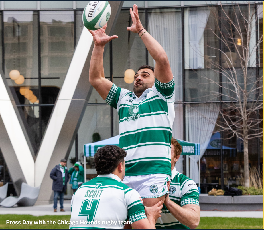
Press Day with the Chicago Hounds rugby team

Check thegreenat320.com for more details and to see the full vendor line-up.