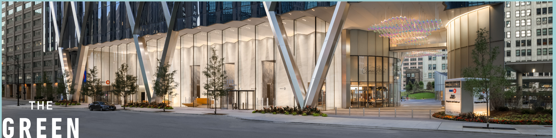
THE GREEN AT 320